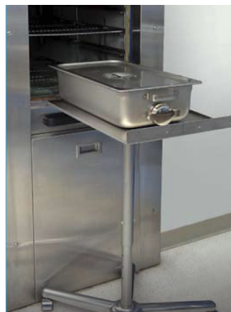
Transports easily from sterilizer to point of use.