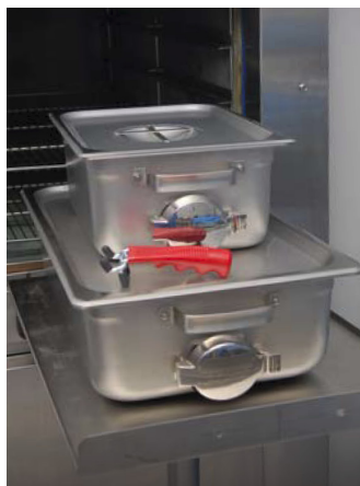
No lifting, burns or back injury.